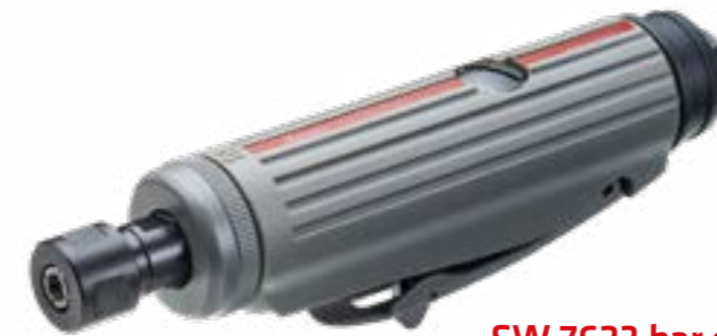
SW 7623 bar grinder