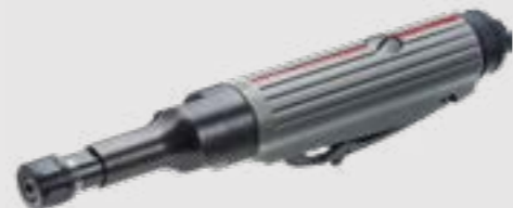
SW 7624 | 783784