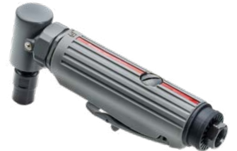
SW 7625 angle grinder