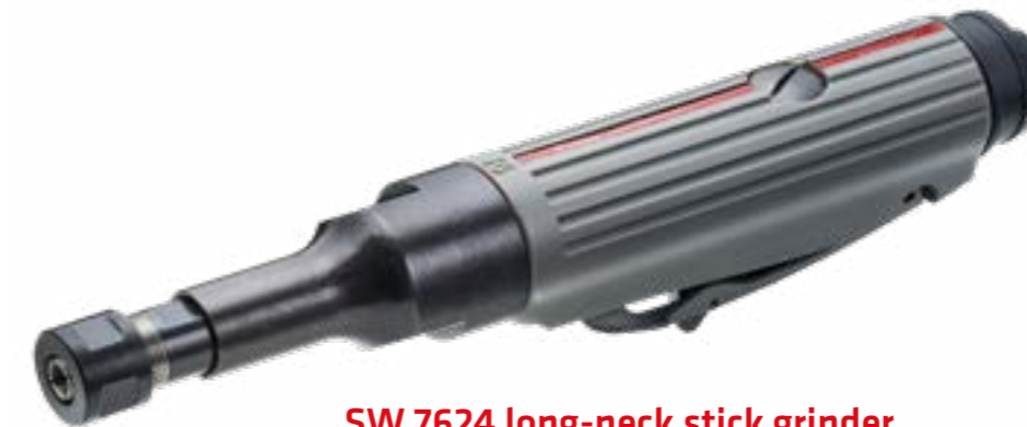
SW 7624 long-neck stick grinder