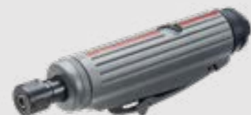
SW 7623 | 783783